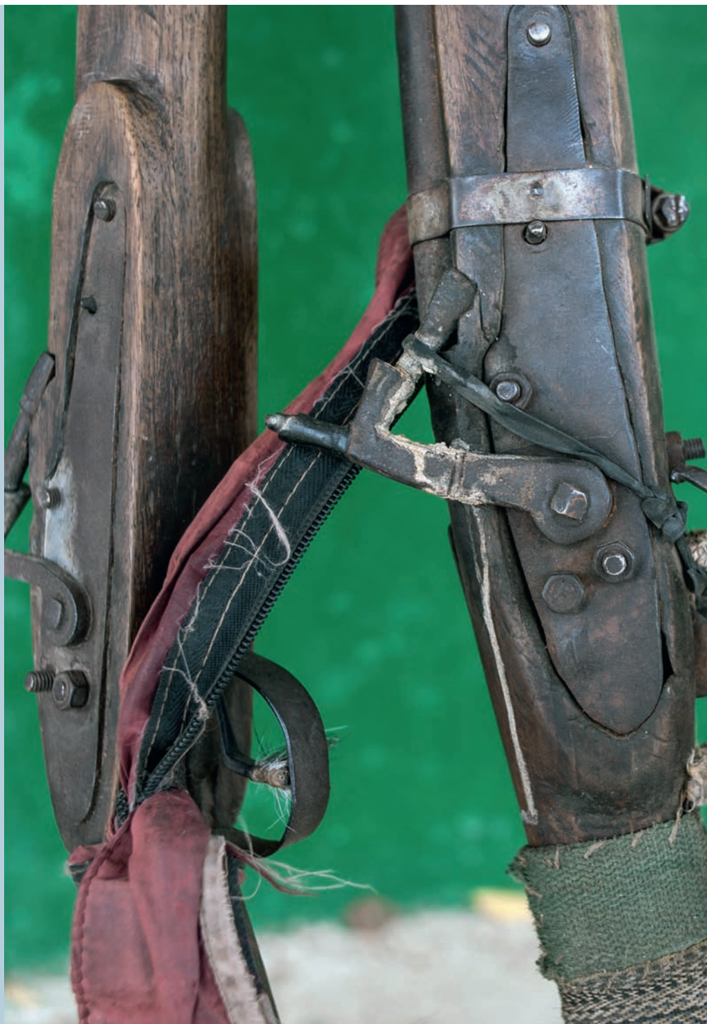
'Dane guns' (craft-produced muzzle loaders) confiscated from poachers and illegal hunters, Yankari Game Reserve, Nigeria, March 2016.

Whether craft guns are included in country totals used by the Small Arms Survey is often not clear. In many countries and territories, craft guns are definitely included in polling and expert estimates, although there is uncertainty about coverage. In some countries, like Mali, for example, few craft gun producers are legally registered (UNREC, 2016, p. 31). Official US statistics cover only the formal market, not guns made from '80 Percent' receivers (Horwitz, 2014), but public surveys presumably capture them. India has relatively imprecise estimates, but they do cover annual production of roughly 2.5 million craft guns (Karp, 2015, p. 63).