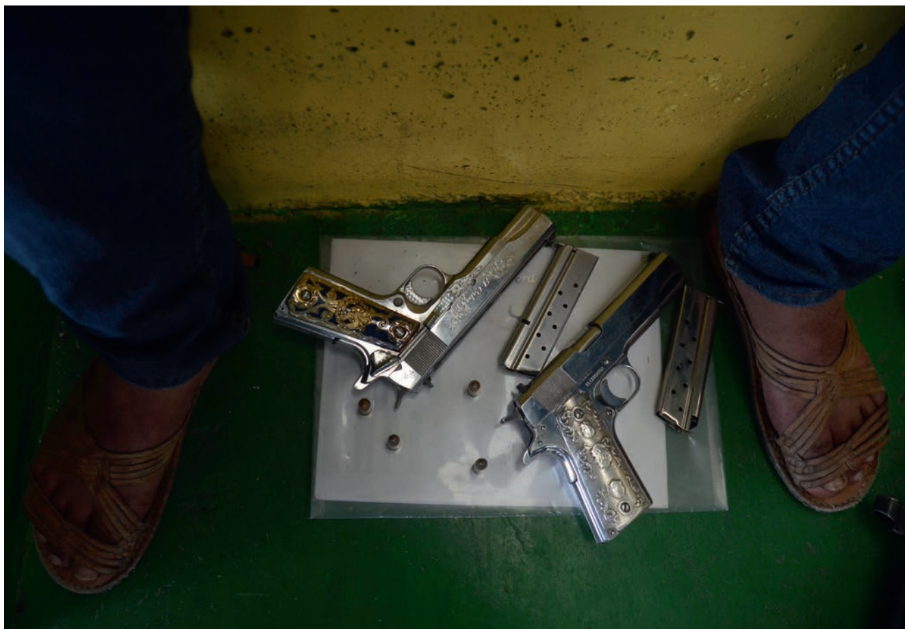
A gun owner waits his turn during a firearms registration programme, Nueva Italia, Mexico, April 2014.

a global total of roughly 100 million registered firearms have been identified in 133 countries and territories (Small Arms Survey, 2018).