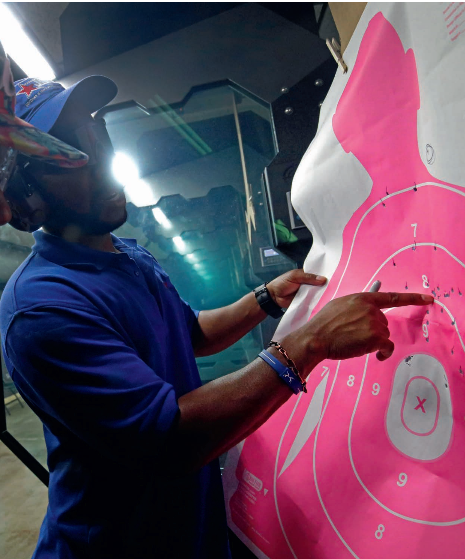
A woman listens to instructions about her practice shooting for her concealed carry certification test, Illinois, United States, July 2017.